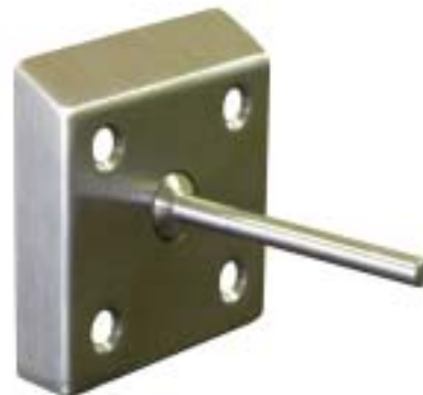
NW 611, Flat Tip

Note: NW 611 with Flat Tip Lever also Available