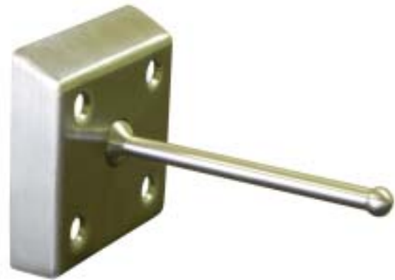
NW 611, Ball Tip