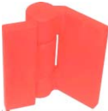
NW 650HSW WITH SHORT LEAF