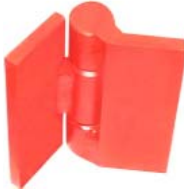
NW 650HSW HALF SURFACE, WELD-ON