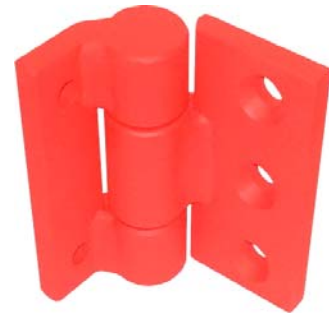
NW 650FSB WITH SPECIAL SHORT LEAF