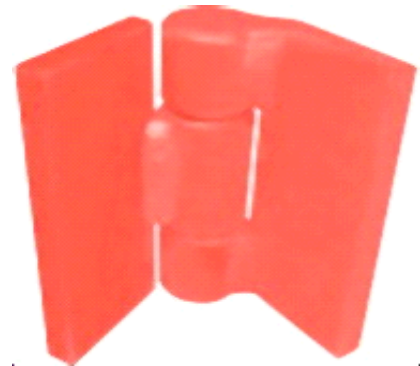
NW 650FSW FULL SURFACE, WELD-ON

Size: 5" x 6" x 1/2" Thick (Full Leaf) 5" x 5" x 1/2" Thick (Short Leaf) Material: Cold-rolled Steel Style: Full Surface (FS Series) Half-surface (HS Series) Pin: Hardened Alloy Steel, Concealed and Non-Removable Bearing: Heavy-Duty Thrust & Radial Bearings Capacity: 600 lb. door (2 hinges) Mounting : Weld-on Finish: USP (prime painted)