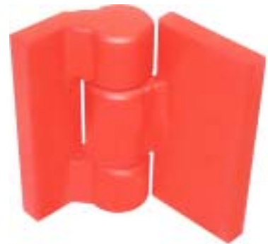
NW 650FSW WITH SHORT LEAF