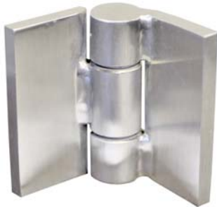
NW 650FSWS FULL LEAF, STAINLESS STEEL

Note: Also available in stainless steel, US32D finish