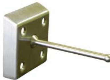
NW 611, Ball Tip

Note: NW 611 with Flat Tip Lever also Available