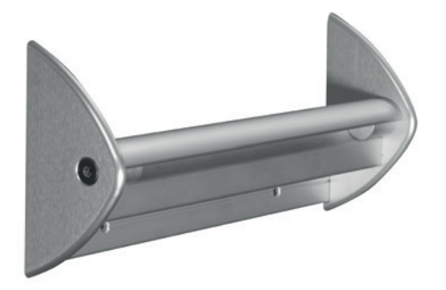
NW SECURITYBAR WITH END CAPS

NW SecurityBar<sup>®</sup> is the ADA compliant heavy-duty grab bar for behavioral healthcare and correctional facilities. NW SecurityBar<sup>®</sup> with end caps eliminates the ligature attachment points and space for hiding items.